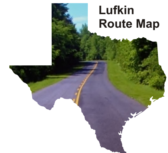
Lufkin Route Map